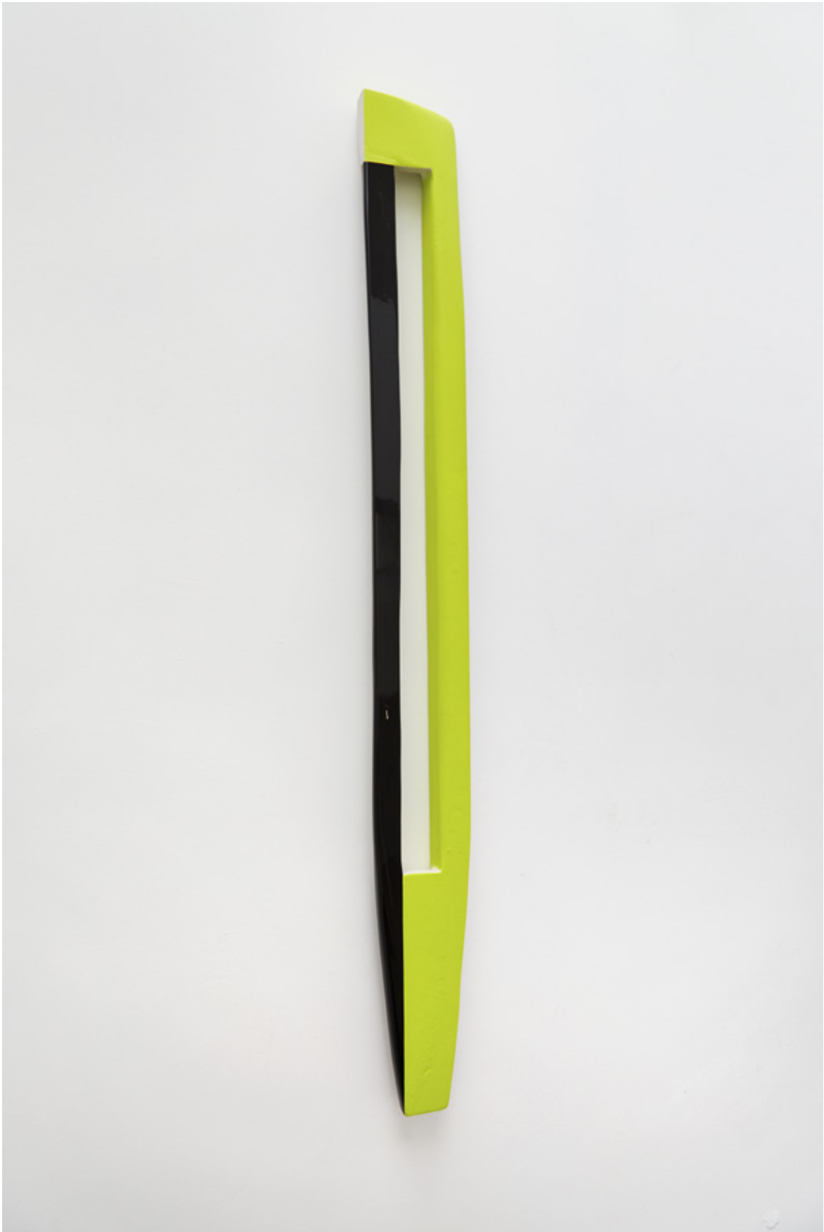
François Maurin , Tiers (Sans Titre) , 2016 Wood, oil paint resin 107 x 10,5 x 3,5 cm