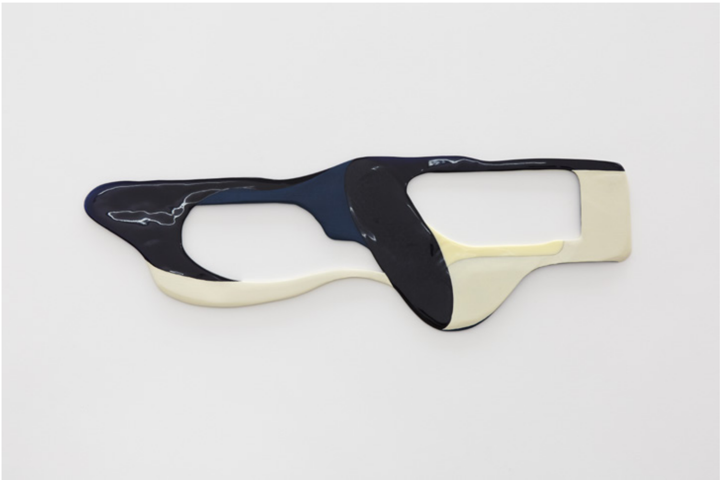
François Maurin , Tiers (Sans Titre) , 2016 Wood, oil paint resin 38 x 110 x 1 cm