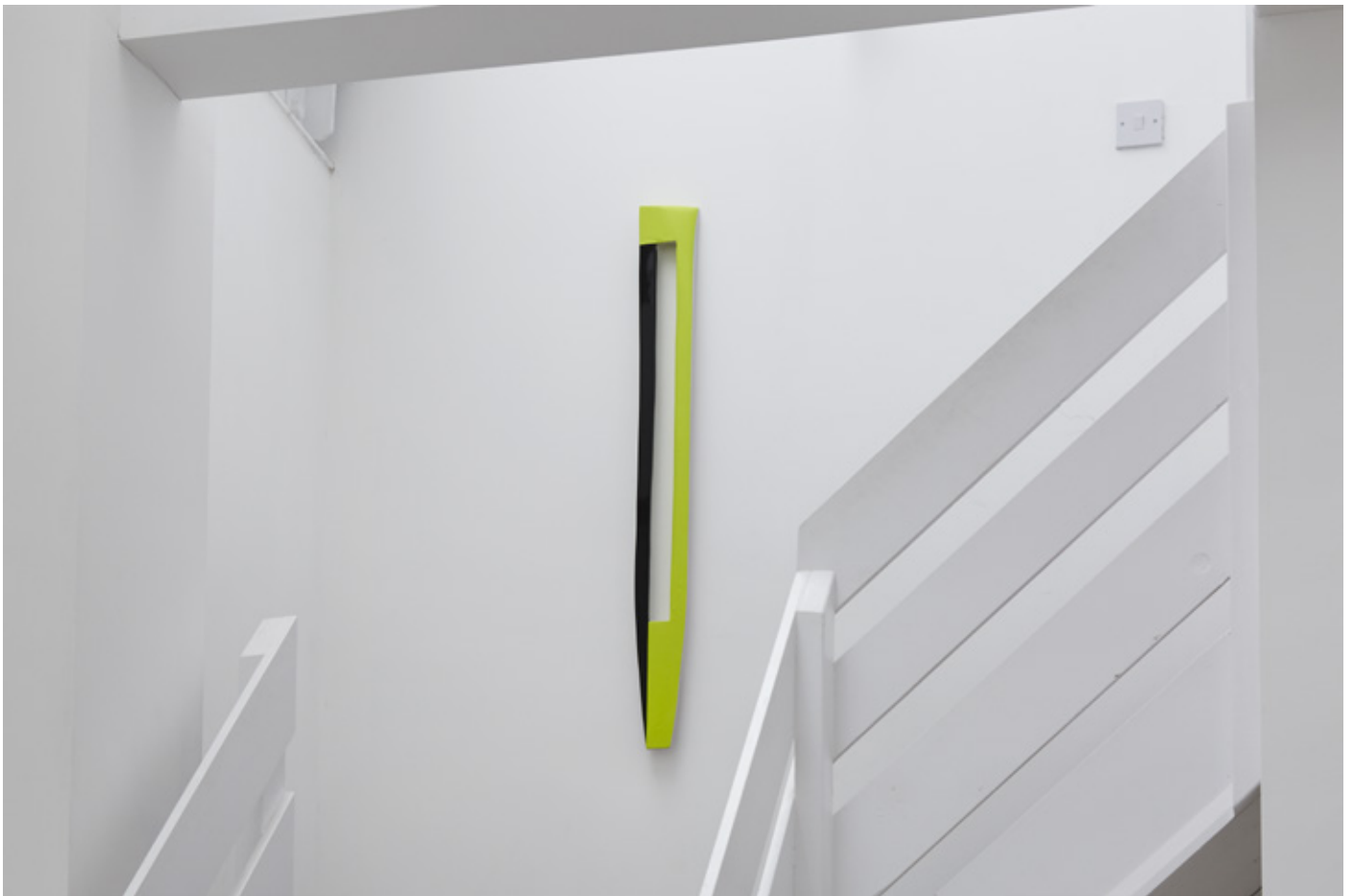
Adult World, 2017 clearview, London Exhibitor view