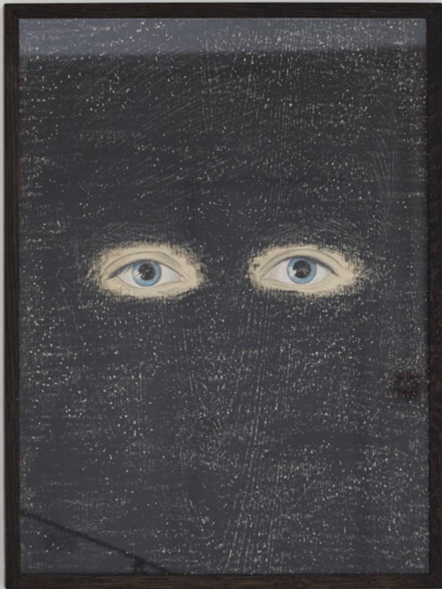
Andrew Mania , Night , 2015 Pencil and pastel on wood 60 x 40 cm