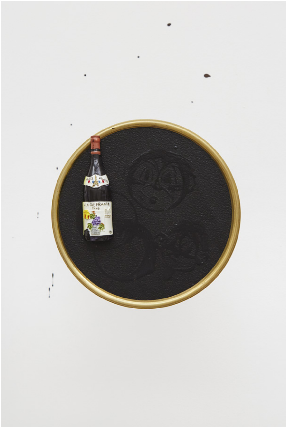
Mathis Collins , Guéridon pour un workshop , detail, 2017 Polyactic acid, acrylic, wood, brass, glass, varnish, Paris magnets, Underberg bottles 22 x 18 x 18 cm each