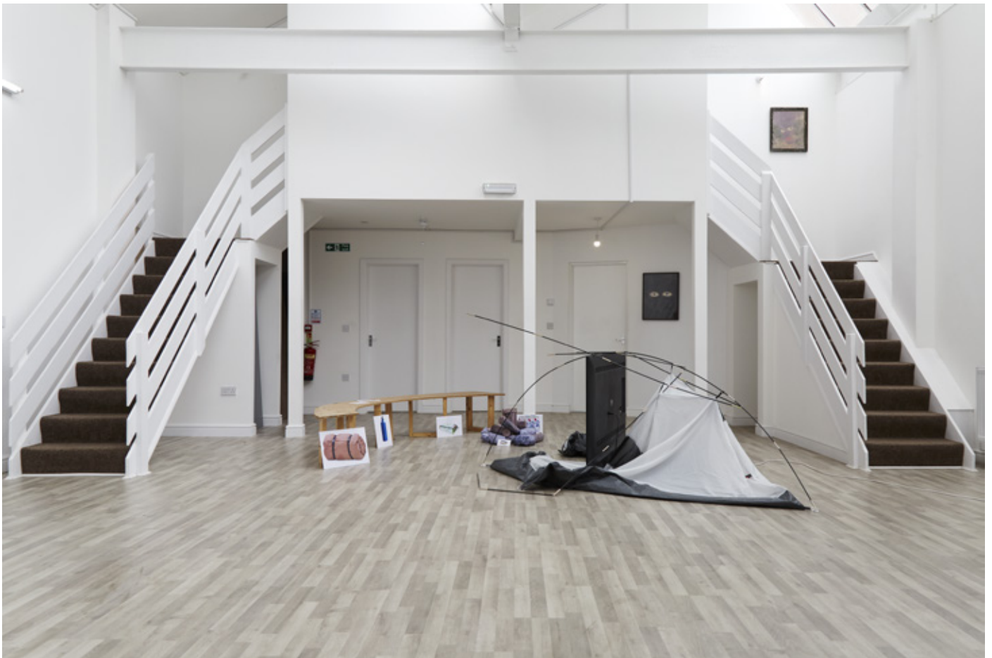
Adult World, 2017 clearview, London Exhibiton view