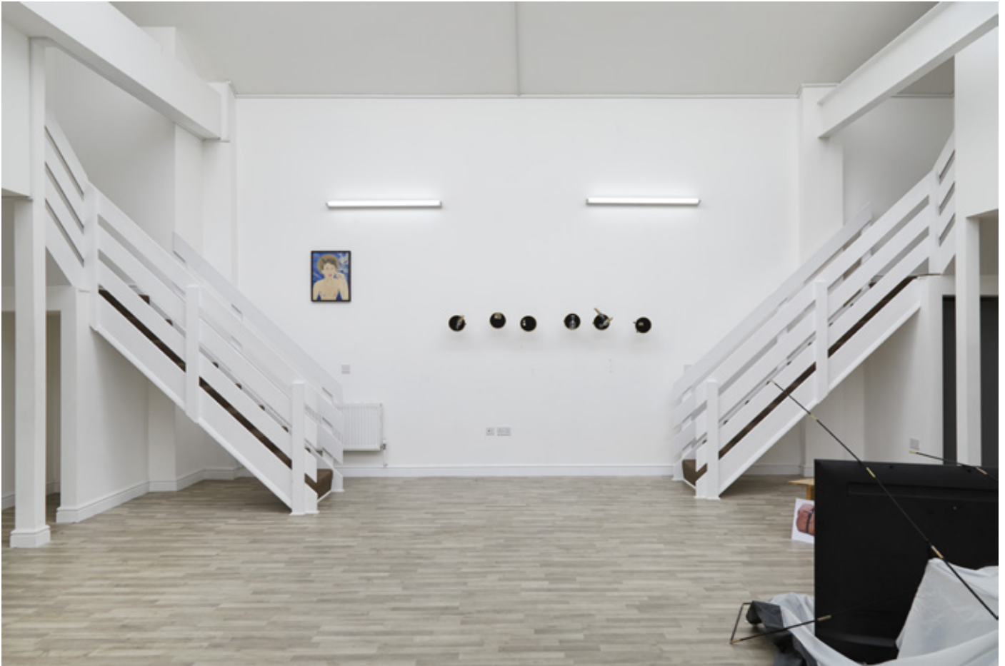
Adult World, 2017 clearview, London Exhibition view