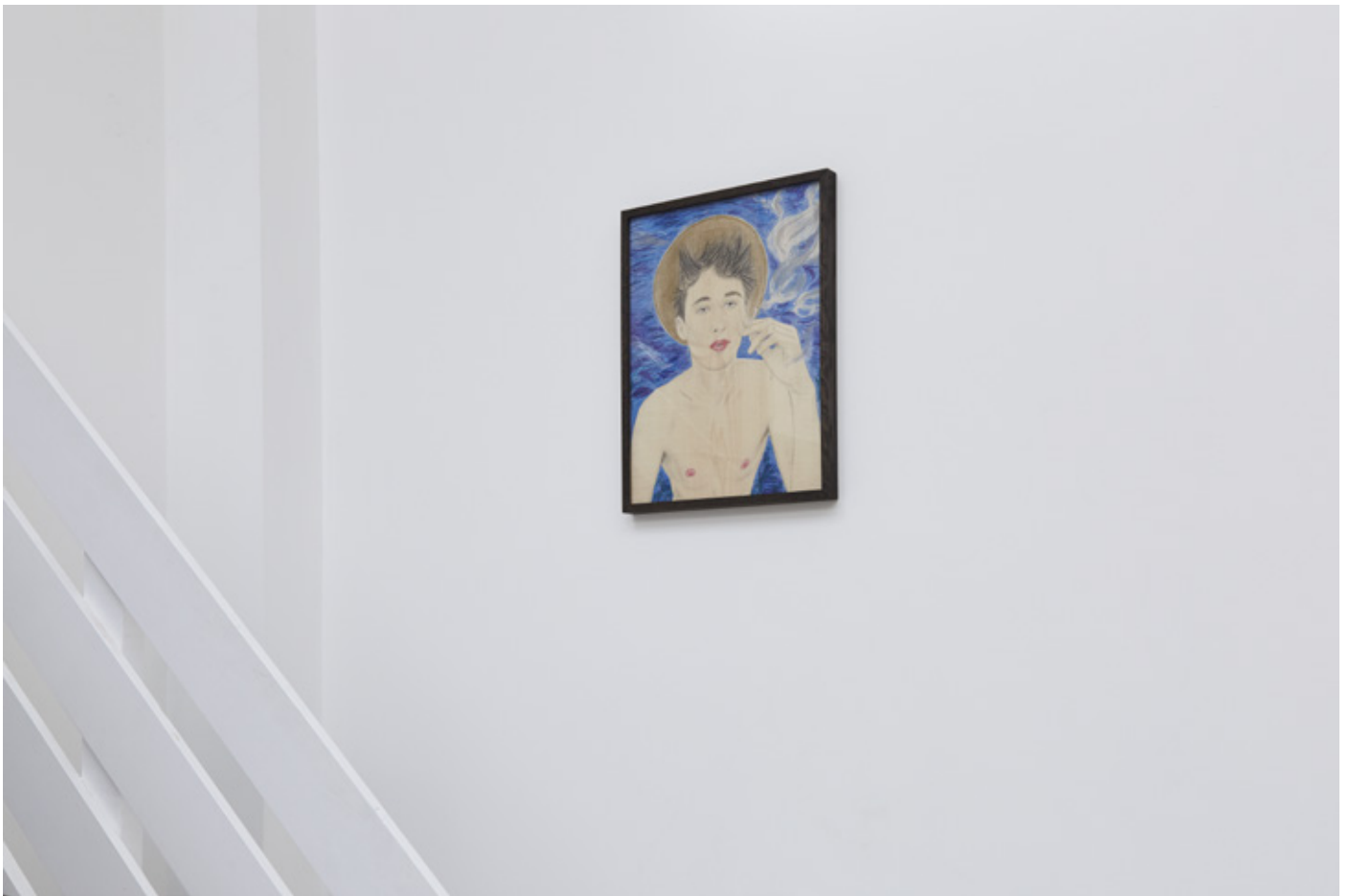
Adult World , 2017 clearview, London Exhibition view