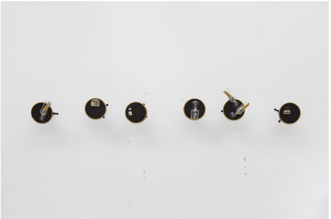
Mathis Collins , Guéridon pour un workshop , 2017 Polyactic acid, acrylic, wood, brass, glass, varnish, Paris magnets, Underberg bottles 22 x 18 x 18 cm each