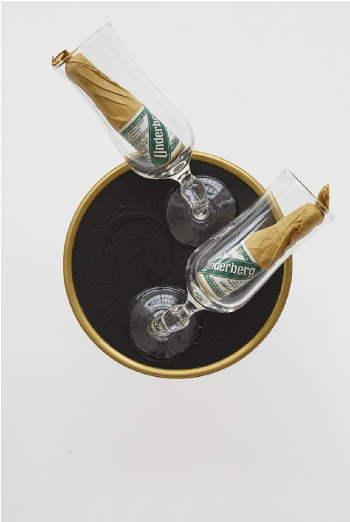
Mathis Collins , Guéridon pour un workshop , detail, 2017 Polyactic acid, acrylic, wood, brass, glass, varnish, Paris magnets, Underberg bottles 22 x 18 x 18 cm each