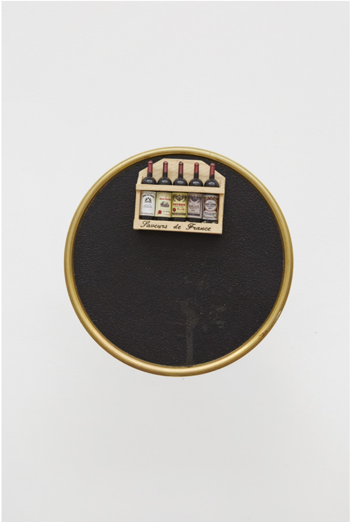
Mathis Collins , Guéridon pour un workshop , detail, 2017 Polyactic acid, acrylic, wood, brass, glass, varnish, Paris magnets, Underberg bottles 22 x 18 x 18 cm each