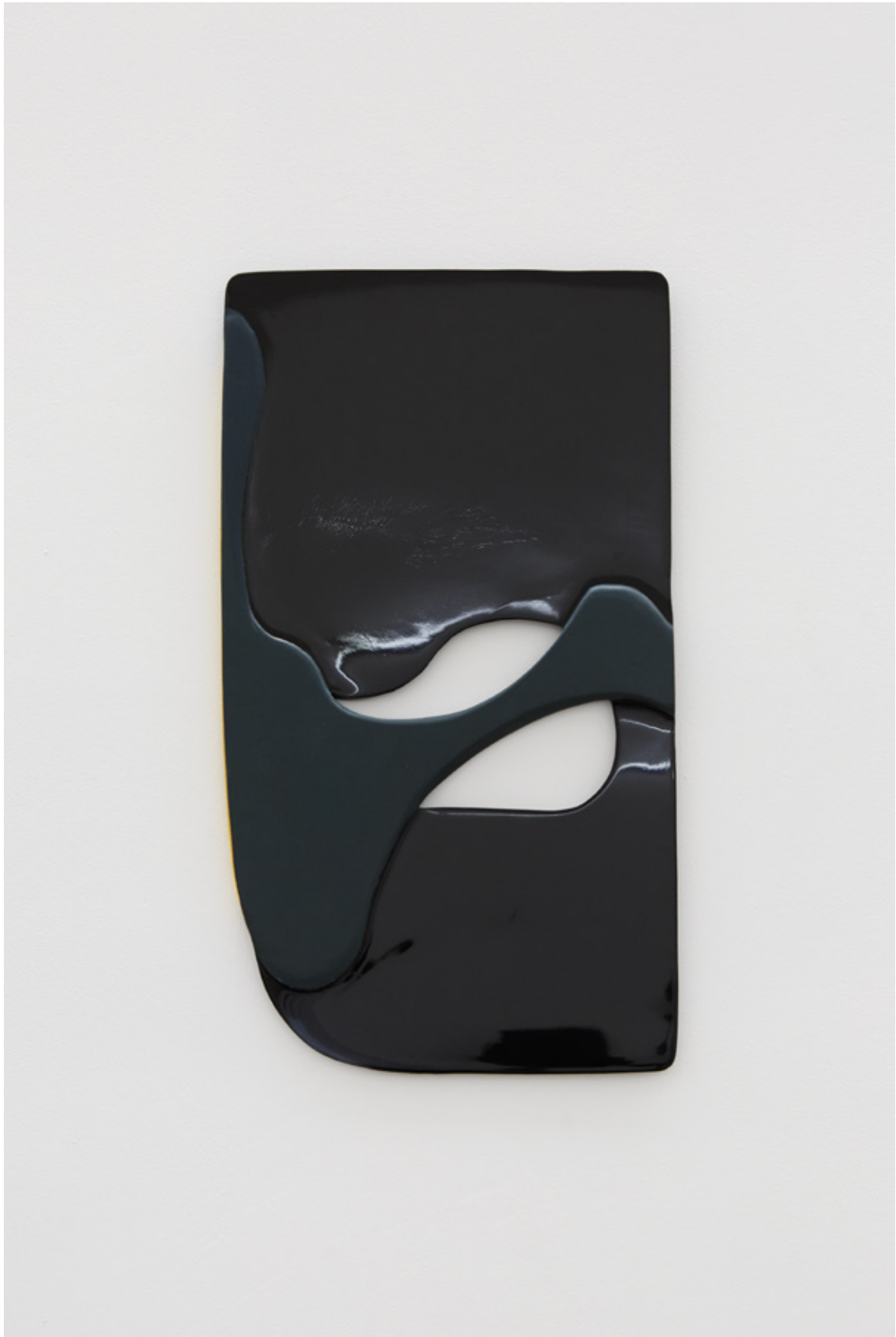
François Maurin , Tiers (Sans Titre) , 2016 Wood, oil paint resin 44 x 29 x 1 cm