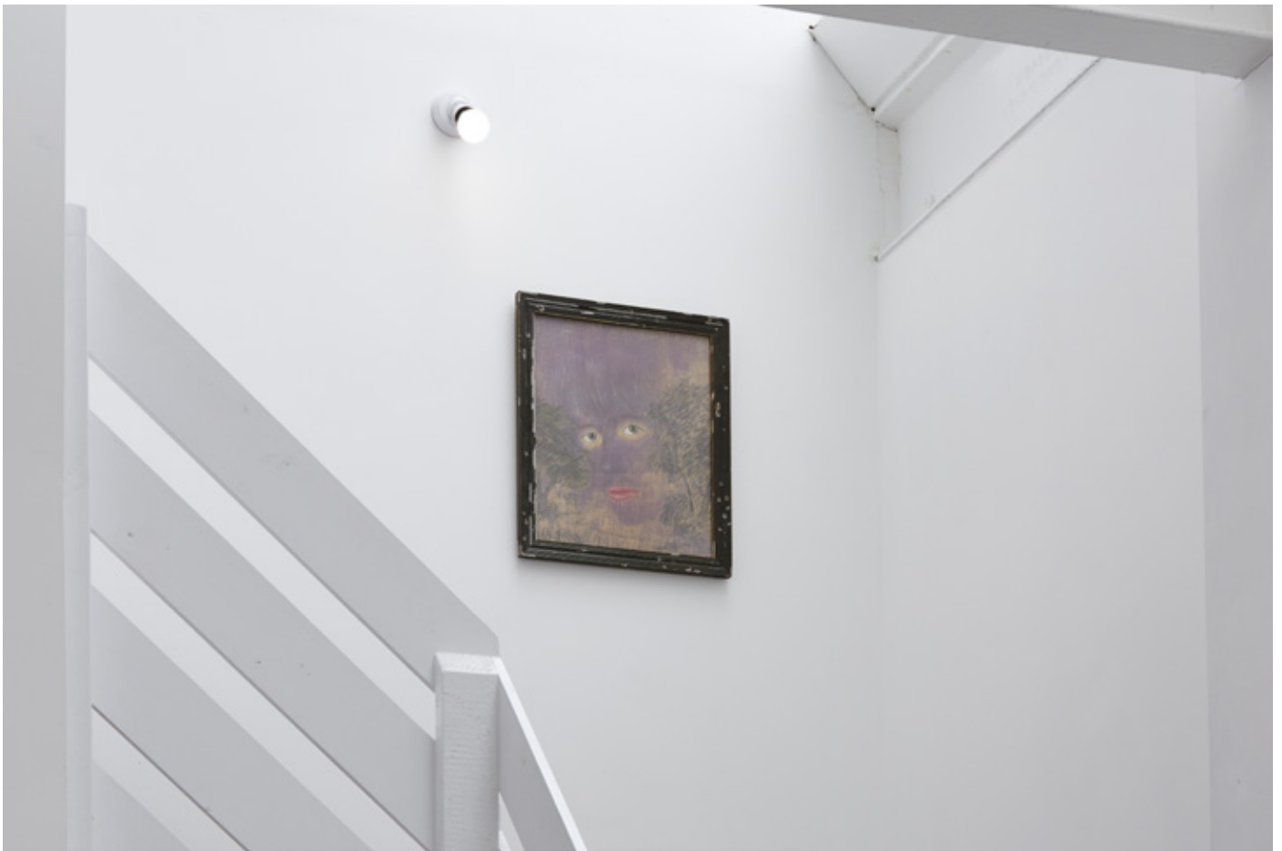
Adult World, 2017 clearview, London Exhibitor view