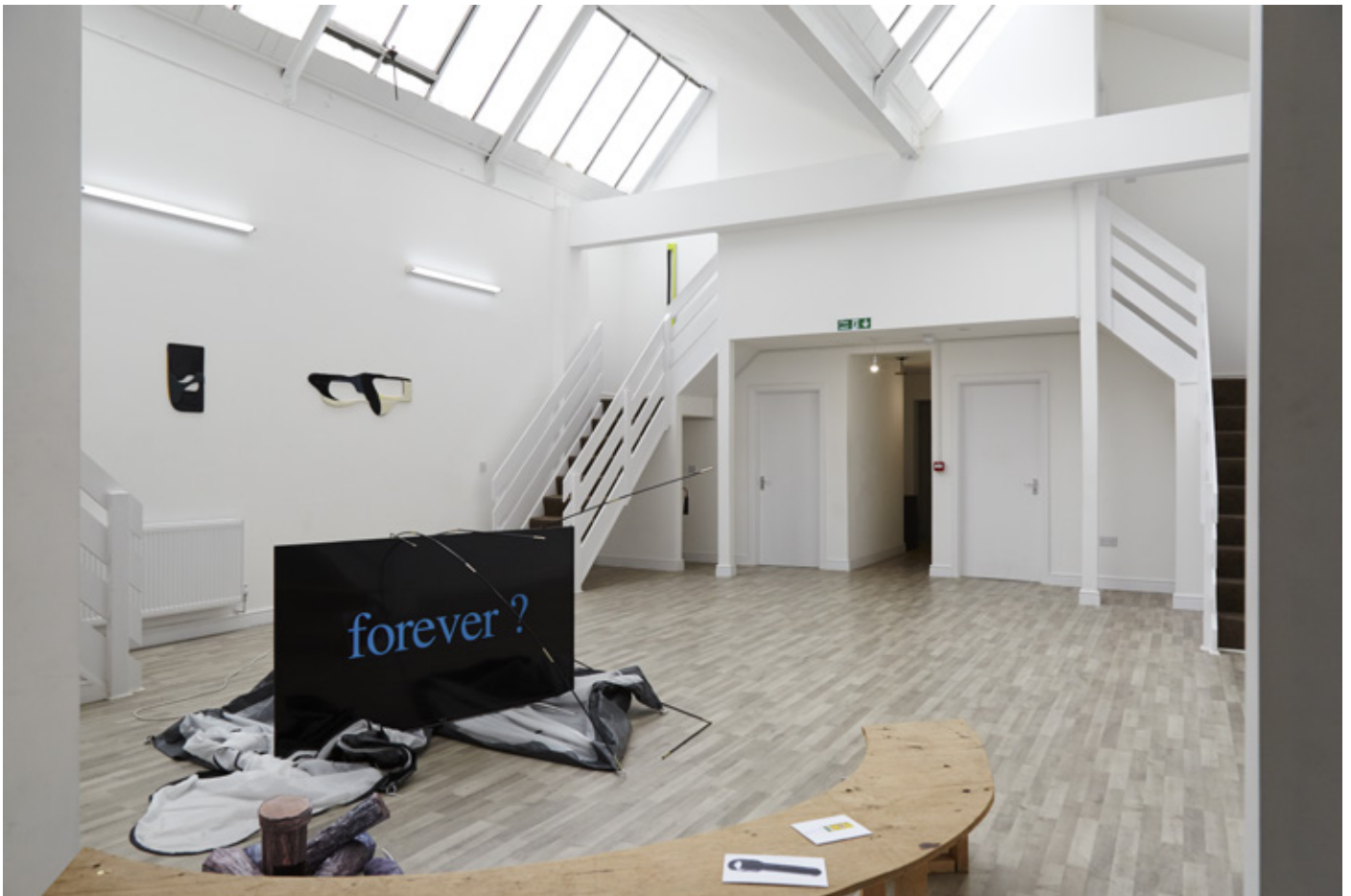
Adult World, 2017 clearview, London Exhibition view