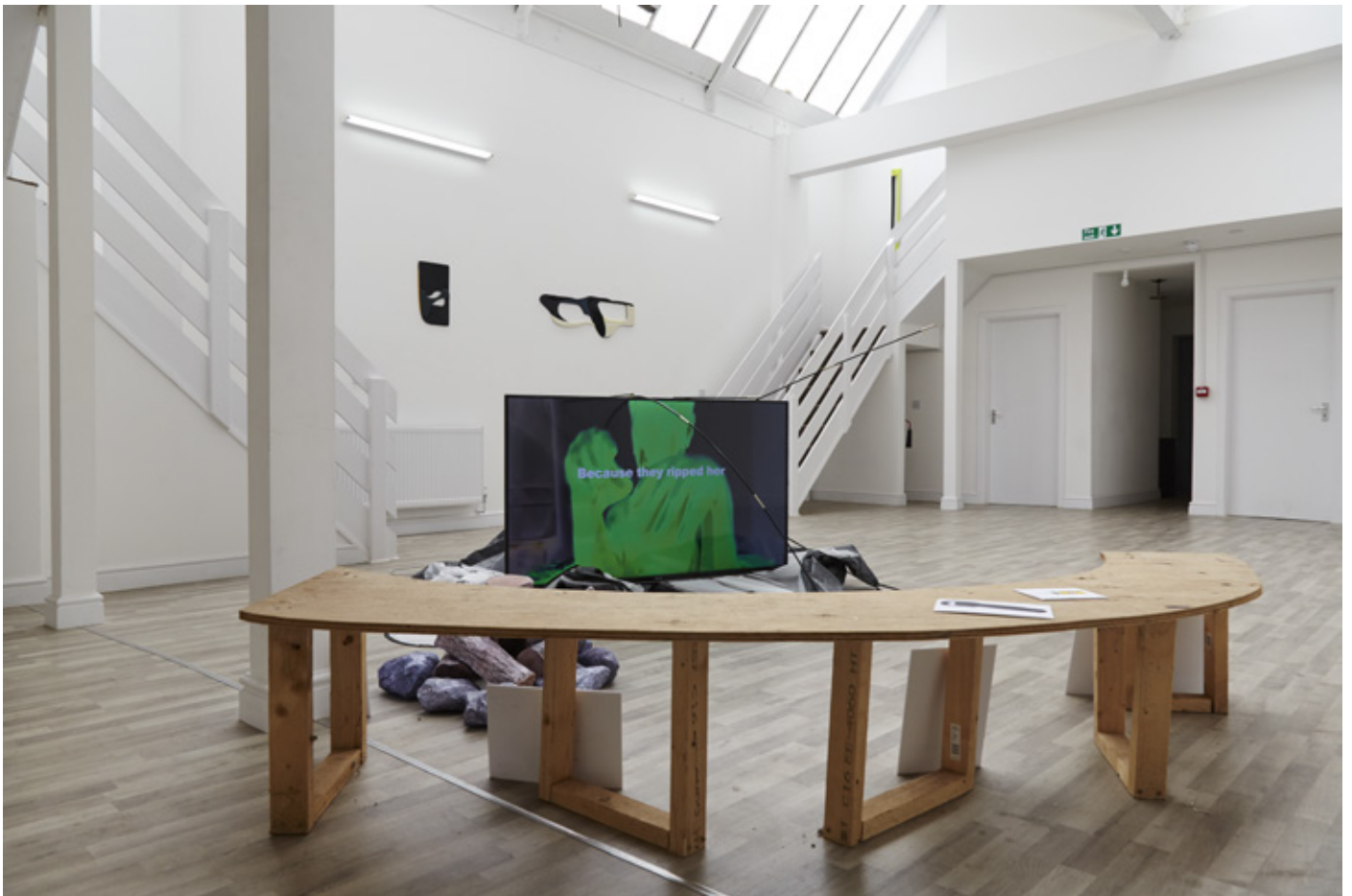
Adult World, 2017 clearview, London Exhibitor view