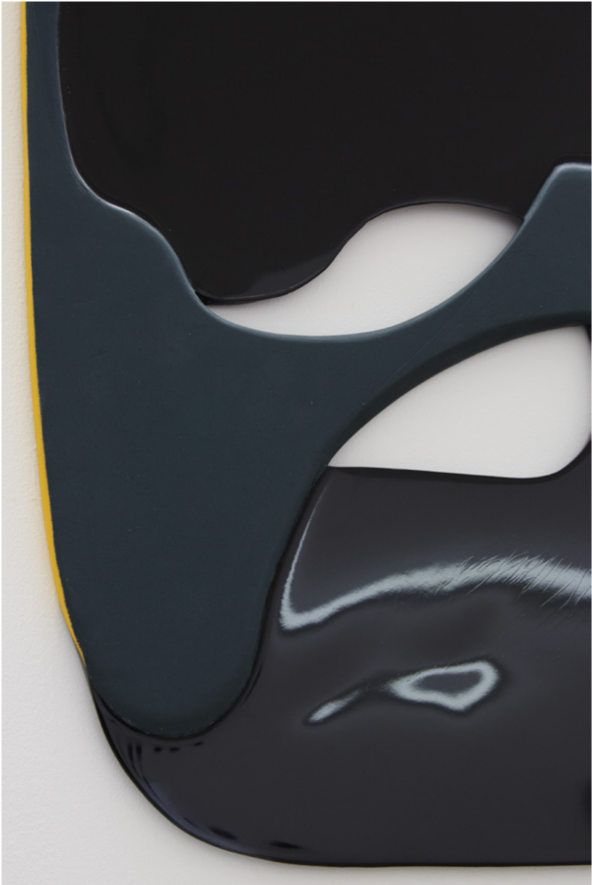
François Maurin , Tiers (Sans Titre) , detail, 2016 Wood, oil paint resin 44 x 29 x 1 cm