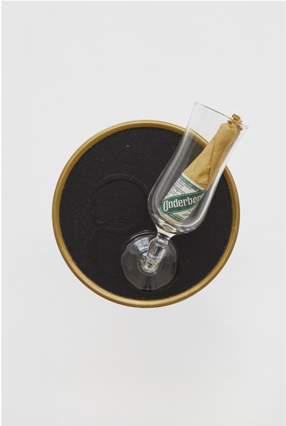
Mathis Collins , Guéridon pour un workshop , detail, 2017 Polyactic acid, acrylic, wood, brass, glass, varnish, Paris magnets, Underberg bottles 22 x 18 x 18 cm each