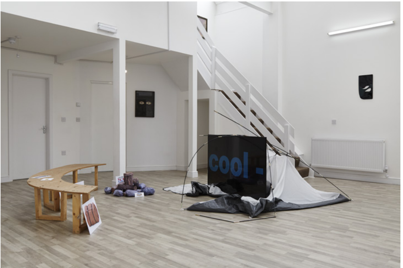
Adult World, 2017 clearview, London Exhibition view