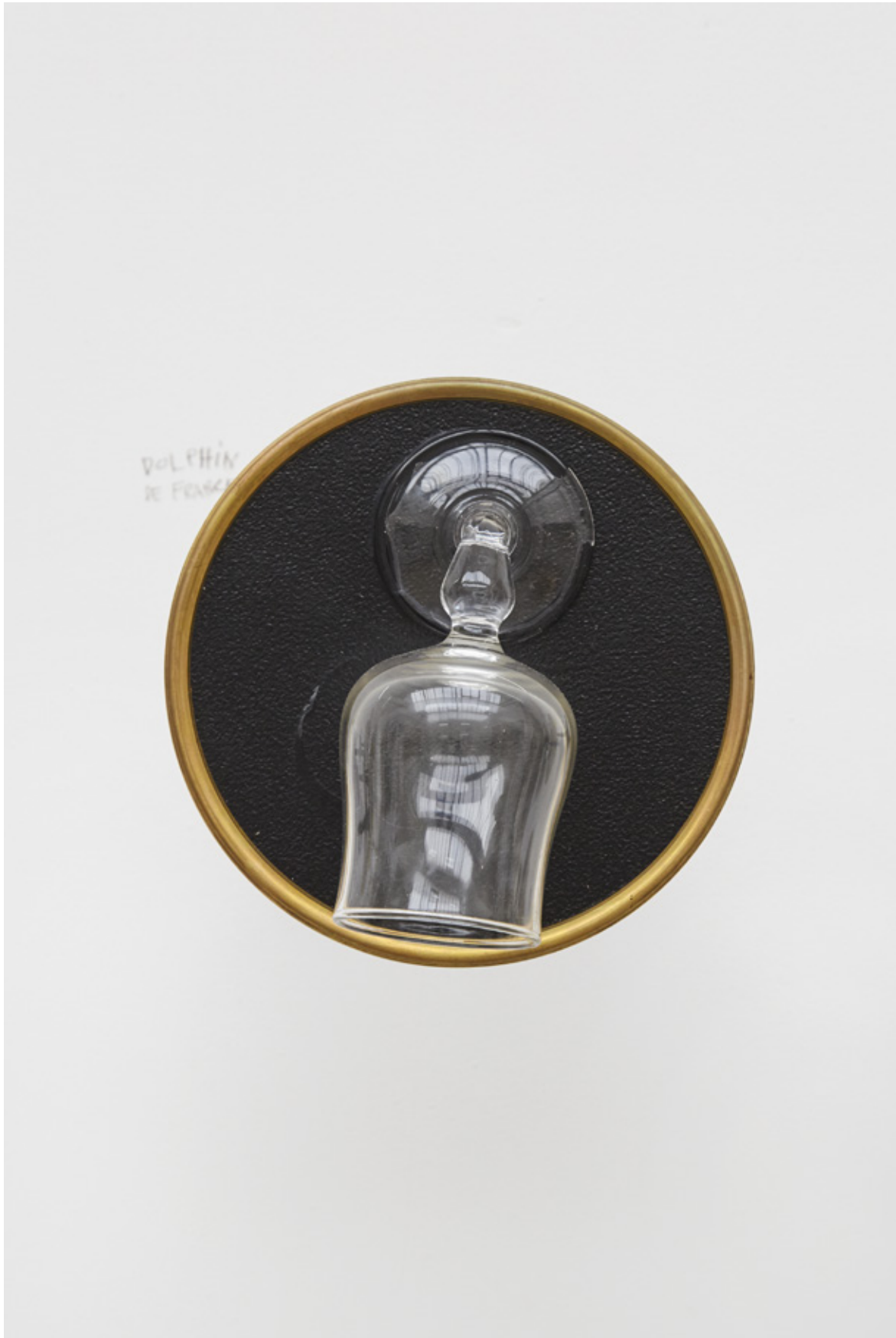
Mathis Collins , Guéridon pour un workshop , detail, 2017 Polyactic acid, acrylic, wood, brass, glass, varnish, Paris magnets, Underberg bottles 22 x 18 x 18 cm each