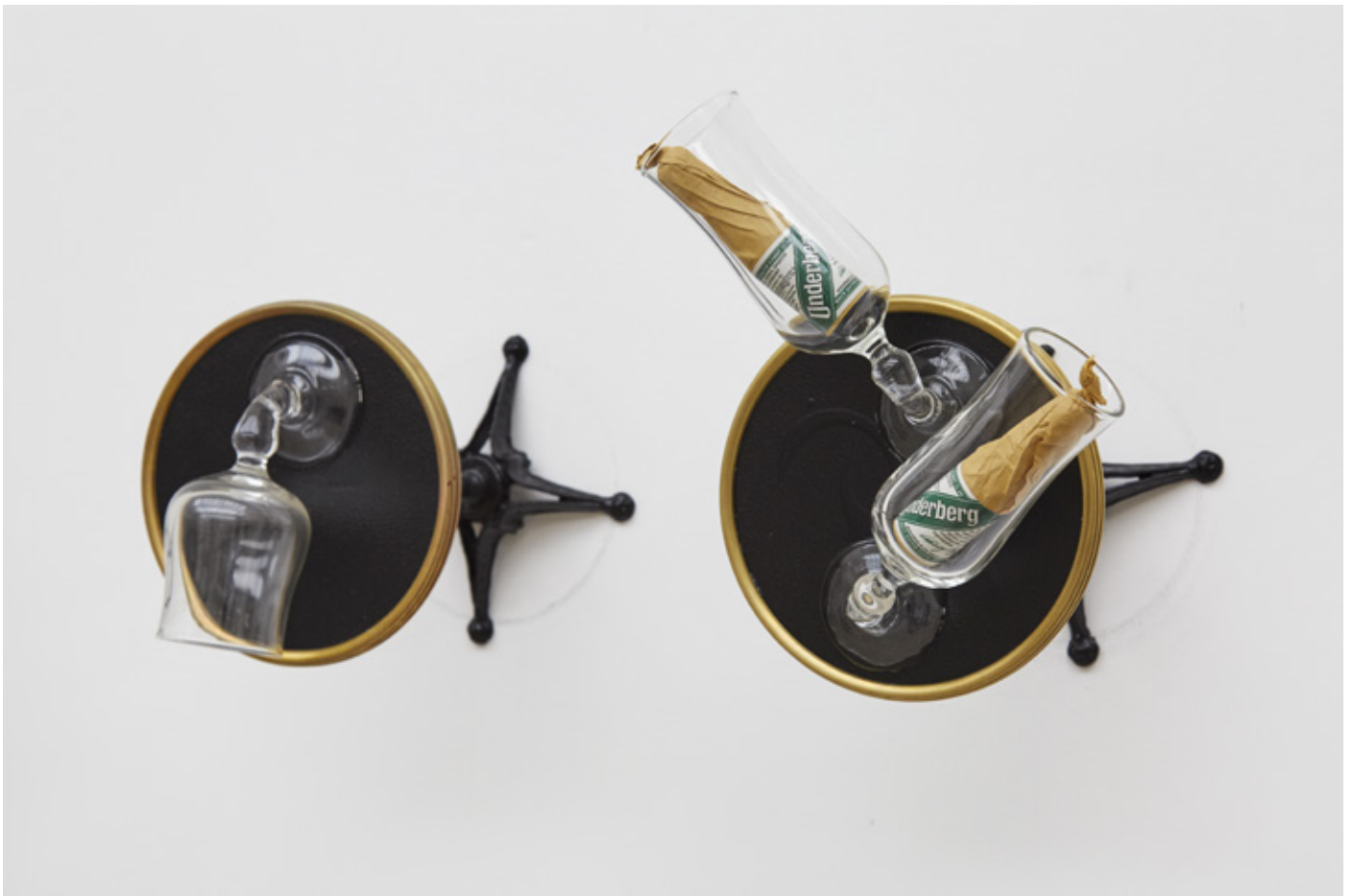
Mathis Collins , Guéridon pour un workshop , 2017 Polyactic acid, acrylic, wood, brass, glass, varnish, Paris magnets, Underberg bottles 22 x 18 x 18 cm each