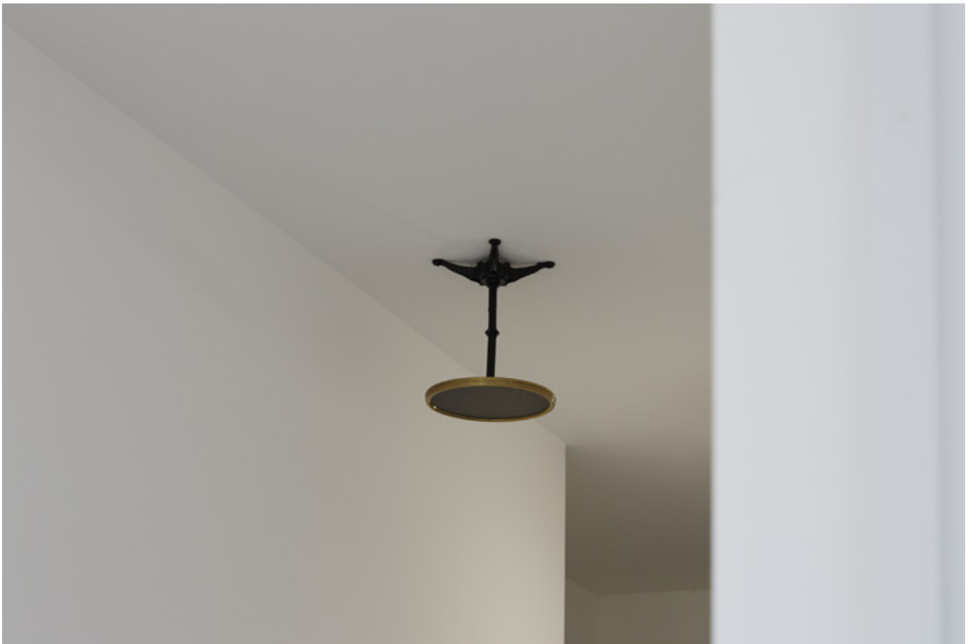
Adult World, 2017 clearview, London Exhibitor view