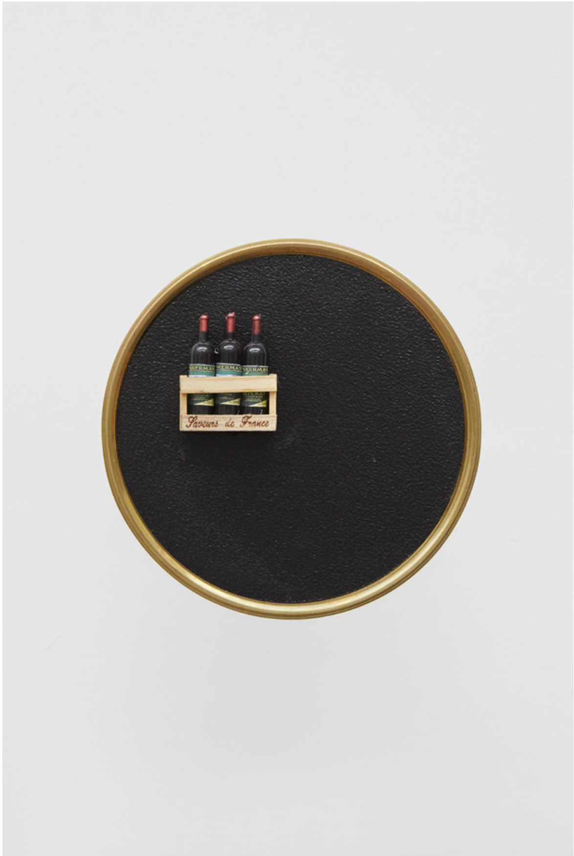
Mathis Collins , Guéridon pour un workshop , detail, 2017 Polyactic acid, acrylic, wood, brass, glass, varnish, Paris magnets, Underberg bottles 22 x 18 x 18 cm each