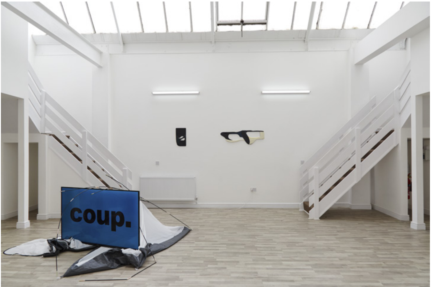
Adult World, 2017 clearview, London Exhibitor view