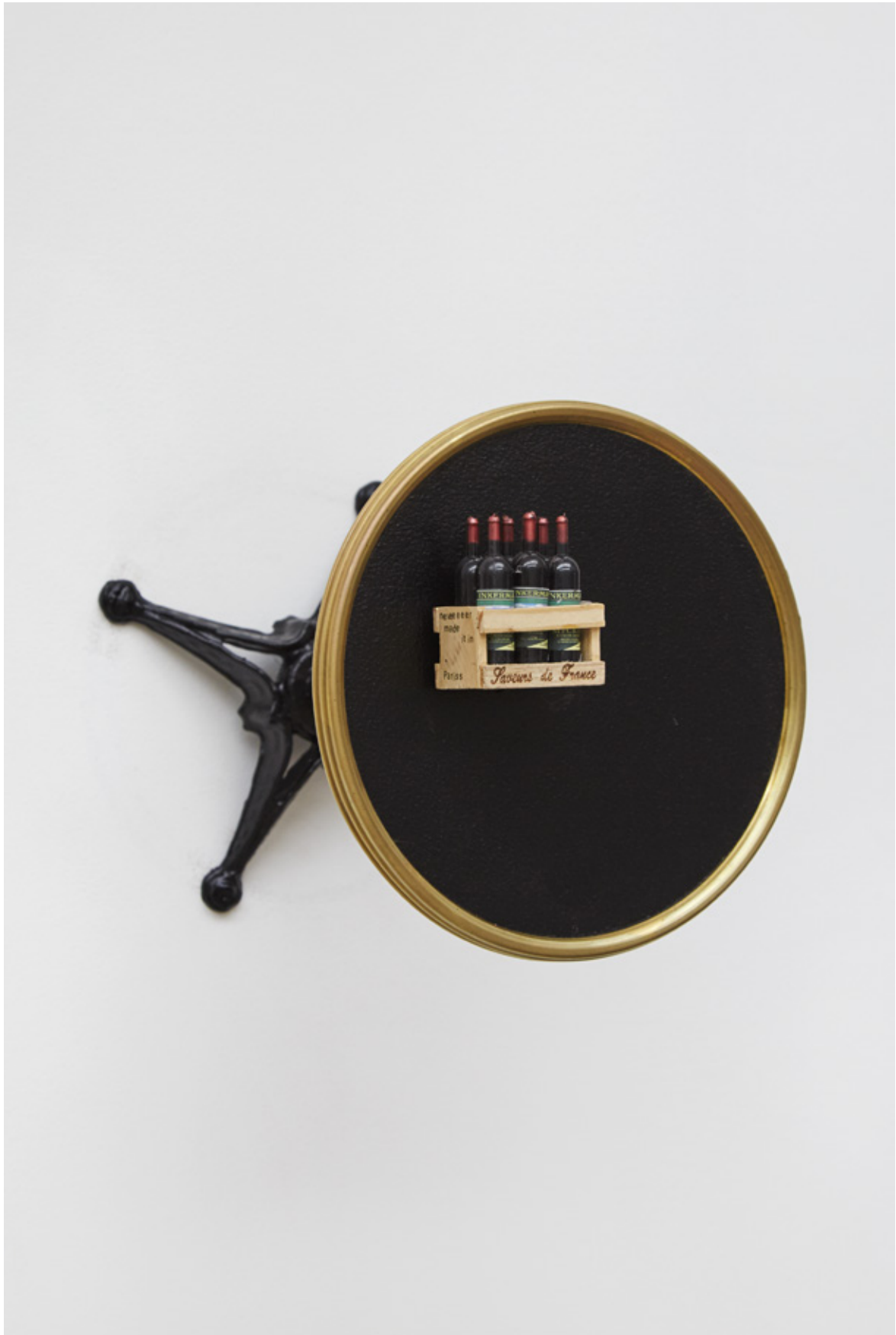
Mathis Collins , Guéridon pour un workshop , detail, 2017 Polyactic acid, acrylic, wood, brass, glass, varnish, Paris magnets, Underberg bottles 22 x 18 x 18 cm each