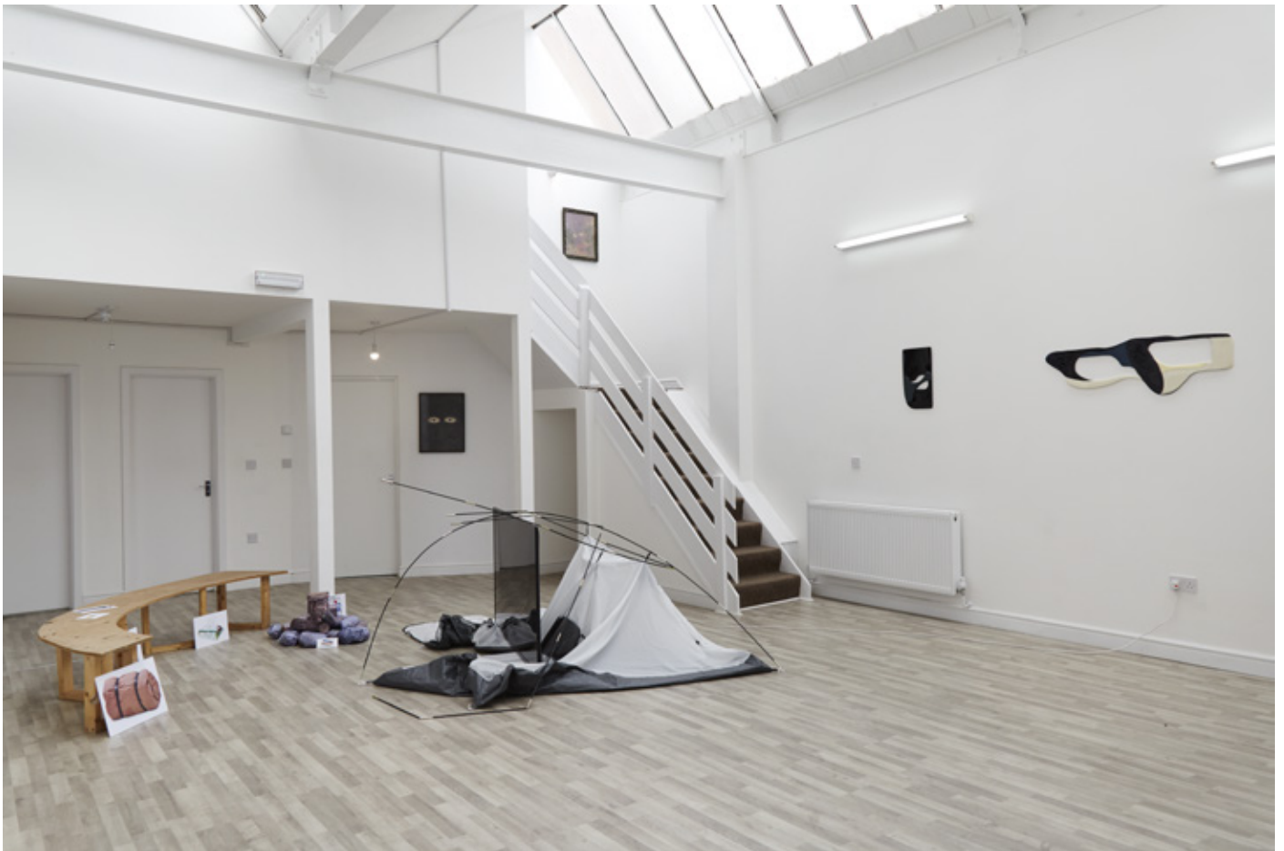
Adult World, 2017 clearview, London Exhibition view