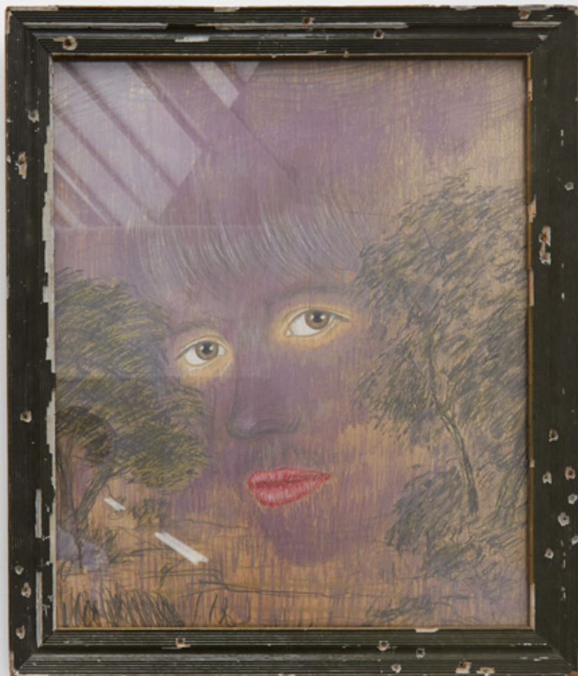
Andrew Mania , Pink Face , 2009 Pencil on wood 54 x 46 cm