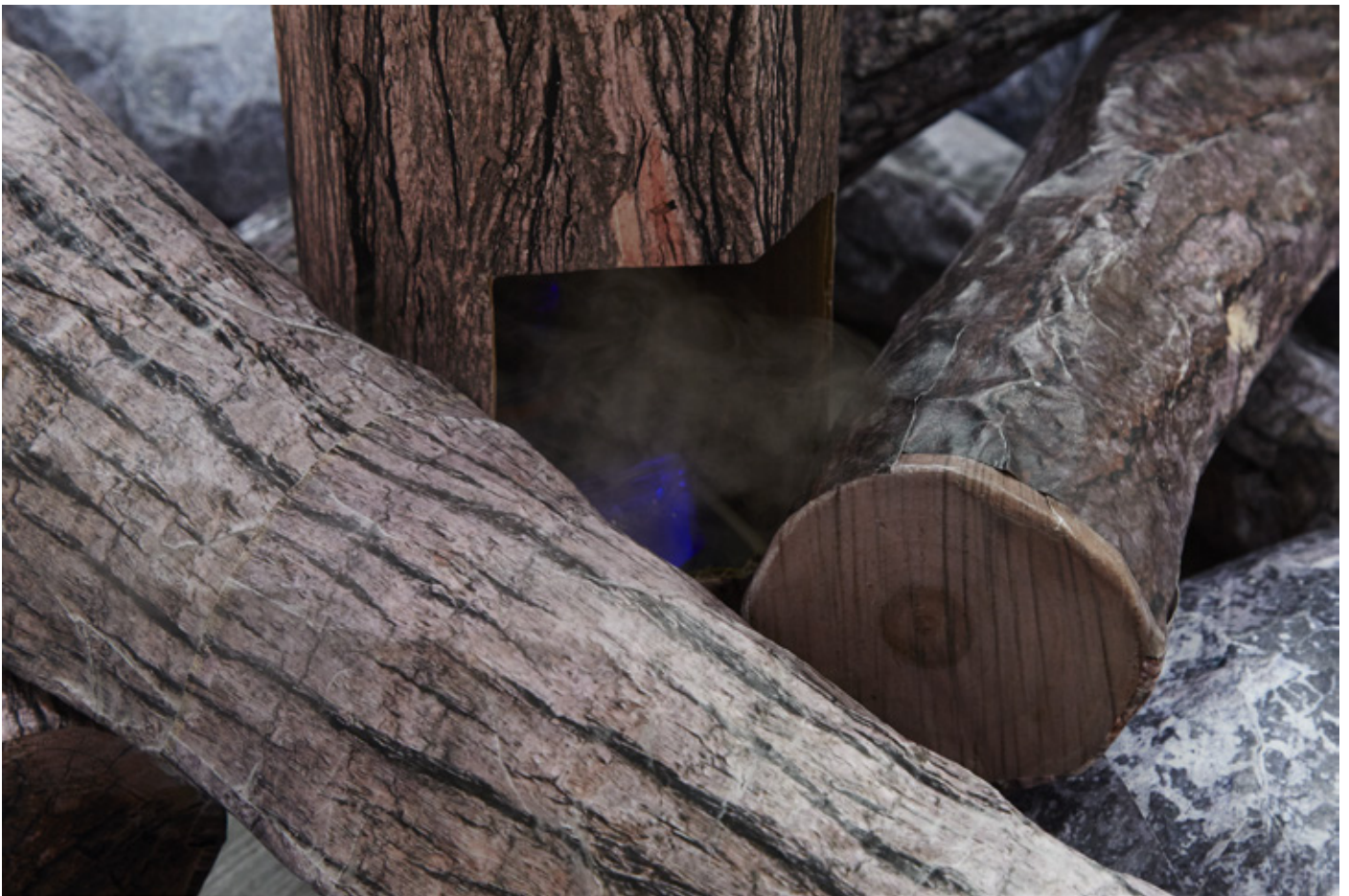
Elsa Philippe , My Goo , detail, 2017 Screen, tents, paper mache, lights, humidifier, prints on cardboard Variable dimensions