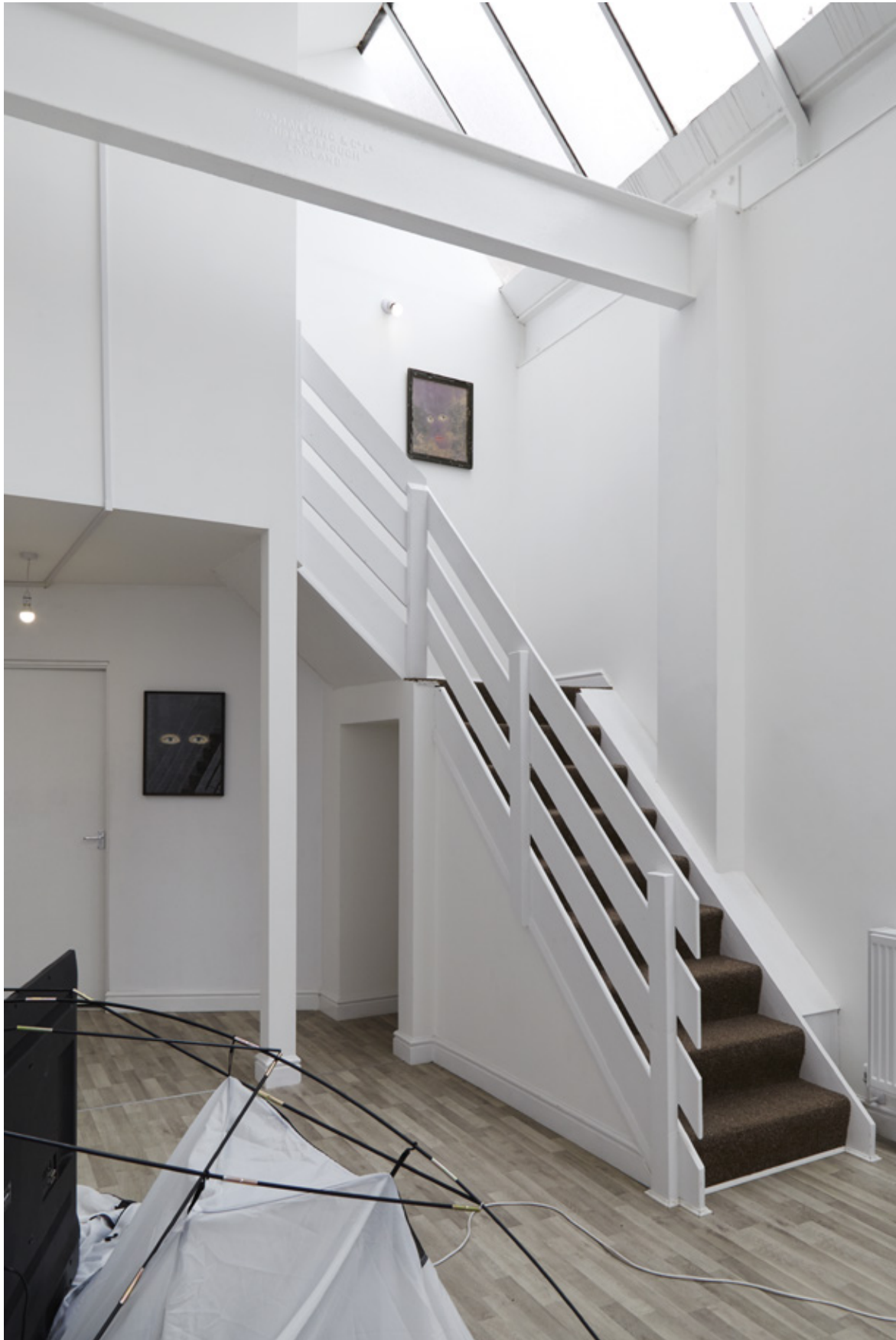
Adult World, 2017 clearview, London Exhibitor view