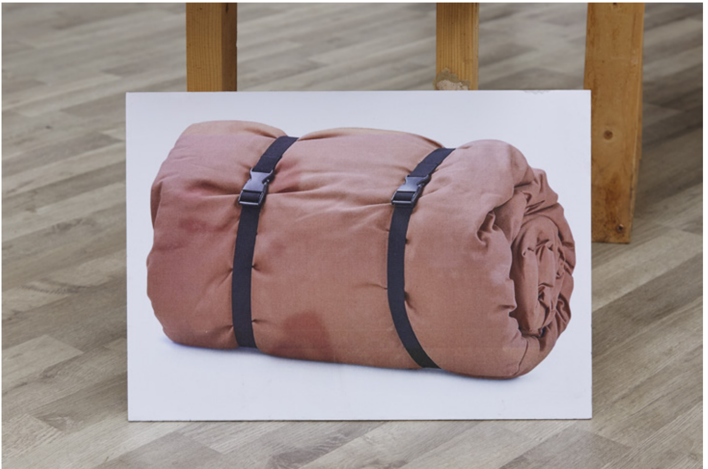
Elsa Philippe , My Goo , detail, 2017 Screen, tents, paper mache, lights, humidifier, prints on cardboard Variable dimensions